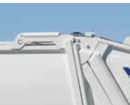
4 Lift cylinders in the hopper roof.