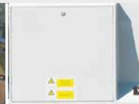
9 Centralised electrical panel within the watertight easy access cab.