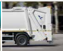
6 Minimum overhang.