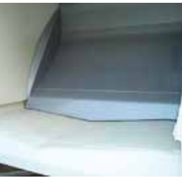
2 Leachate tank at the bottom of the body.