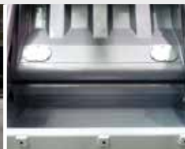
7 High absorption capacity press.