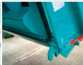
5 Bio gasket seal.