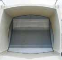
1 Ejector plate perfectly fitted to the body.